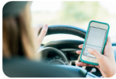
Texting & Driving