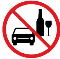
Driving Under the Influence