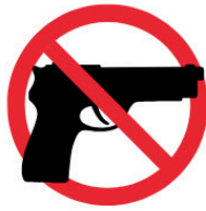
Weapon in Vehicle